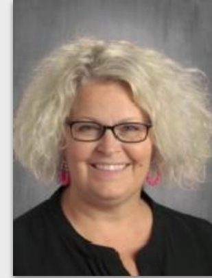
Laura Ryan Heritage Elementary