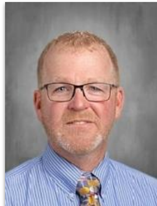
Ben Muller Prairie Trail Elementary